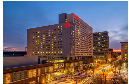
The Hilton Baltimore, Baltimore, MD Site of 2019 67th Annual Meeting of the Association of University Radiologists